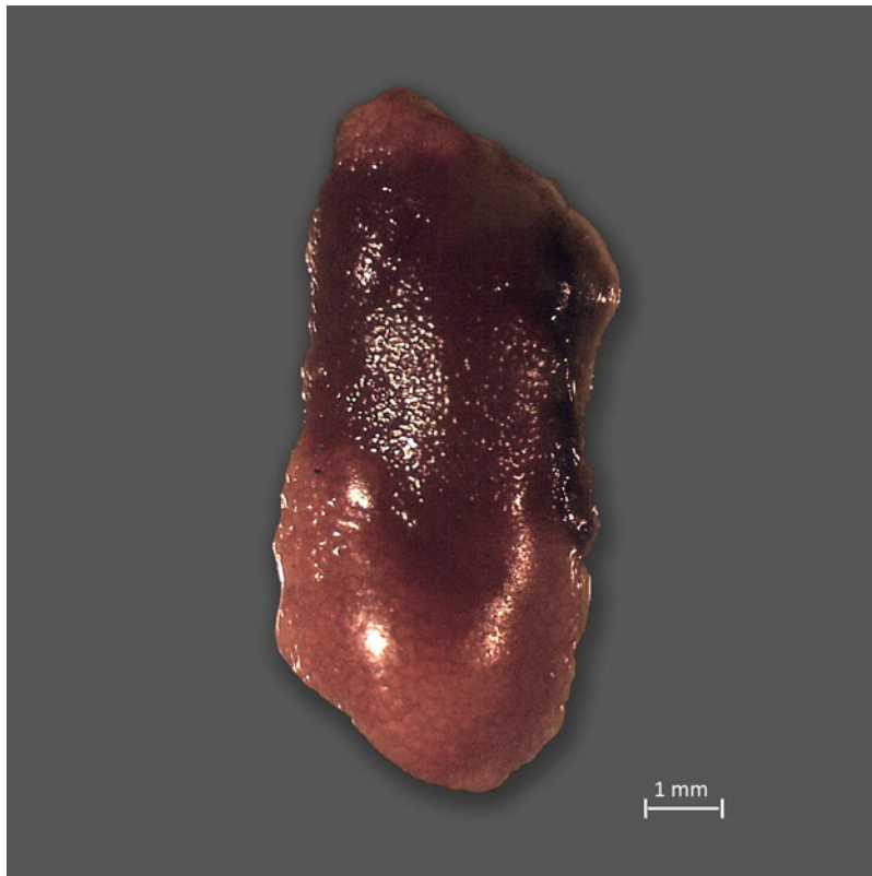
Fig. 1. Hermaphrodite gonad of Patella piperata , where the ovary is represented by the central dark area and the testis is represented by the lighter areas.