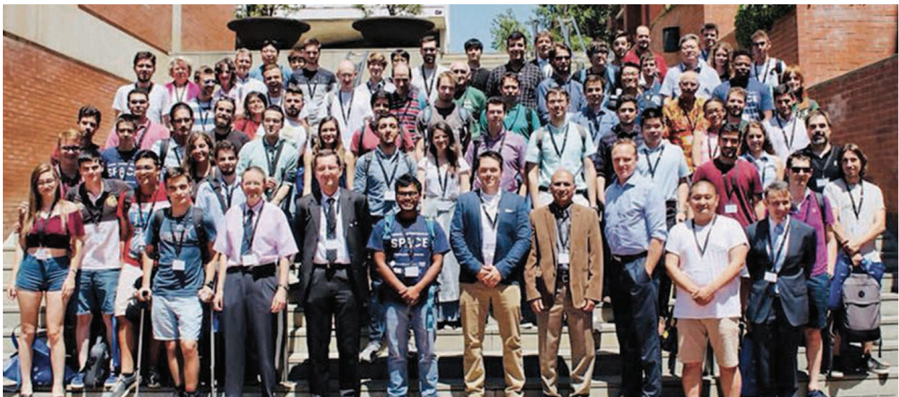
FIGURE 4. Attendees, professionals, and organizers from the 2018 Young Professionals in Space Conference in Barcelona.