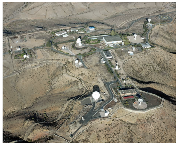
FIGURE 5. A panoramic view of the Maspalomas Tracking Station, managed by the Instituto Nacional de Técnica Aeroespacial.