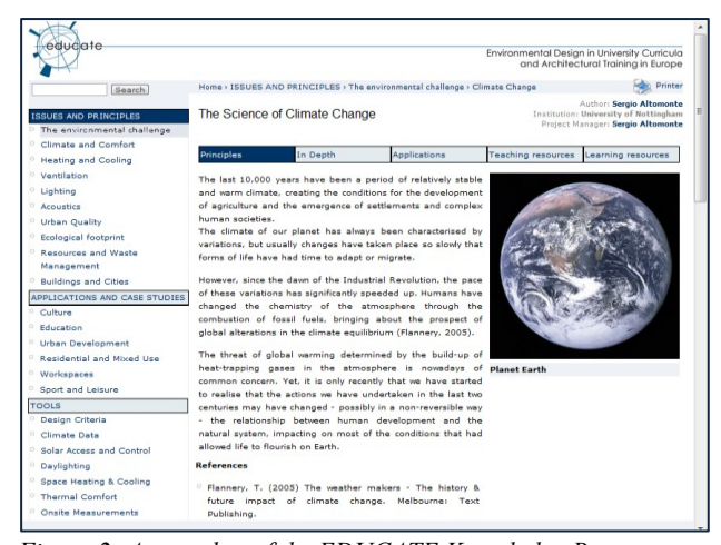
Figure 2: A snapshot of the EDUCATE Knowledge Base

Knowledge Base - The publicly accessible online Knowledge Base (KB) represents the collected expertise of the consortium partners in key concepts of sustainable environmental design (https://www.educatesustainability.eu/kb). The KB has been structured in three parts: Issues and Principles, Applications and Case Studies, and Tools. Each of the three parts is organised in a primary 'ontology' - generally subdivided in categories and clusters - which forms a key element of content retrieval. Each cluster groups a related set of topics, case studies and practical resources. The material relating to each topic, case study and tool, is presented in the form of five aspects or 'tabs', which offer different views on the contents (Fig. 2). The Knowledge Base is not limited to a tree structure (i.e., sections and subsections), but rather it features several 'horizontal' links between contents in its different parts, and makes use of links to external references and websites where appropriate.