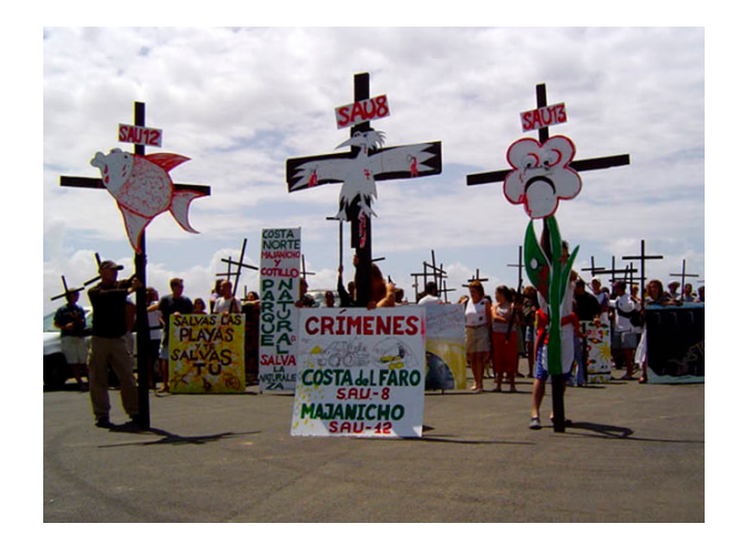
Figure 6. Image of citizen protests due to the development of Cotillo and Majanicho urban plans, in La Oliva Town, Fuerteventura.

This case therefore provides the opportunity to turn a participatory process, as part of an ex-post environmental impact assessment (encouraged partly by citizens and partly by the public administrations involved), into a programme: "Citizen participation programme in the framework of the Environmental Impact Assessment for the Majanicho housing development project—SAU 12, La Oliva (Fuerteventura)". In the short term, this could contribute to the design and adoption of the appropriate compensatory measures, and in the medium to long term, it could result in the