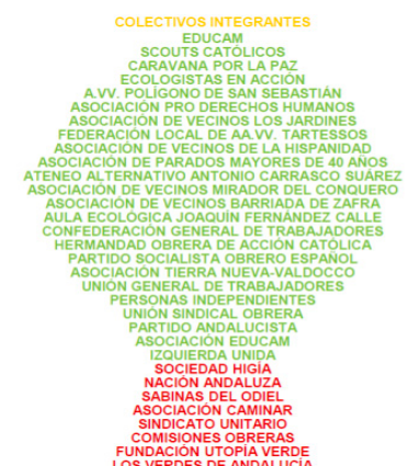
PLATAFORMA PARQUE MORET-PULMÓN VERDE DE HUELVA

platform, which brought together numerous groups (see Figure 1), succeeded in persuading the public administration to invite tenders for the project based on a set of specifications that both parties (platform and administration) had previously agreed during a series of workshops.