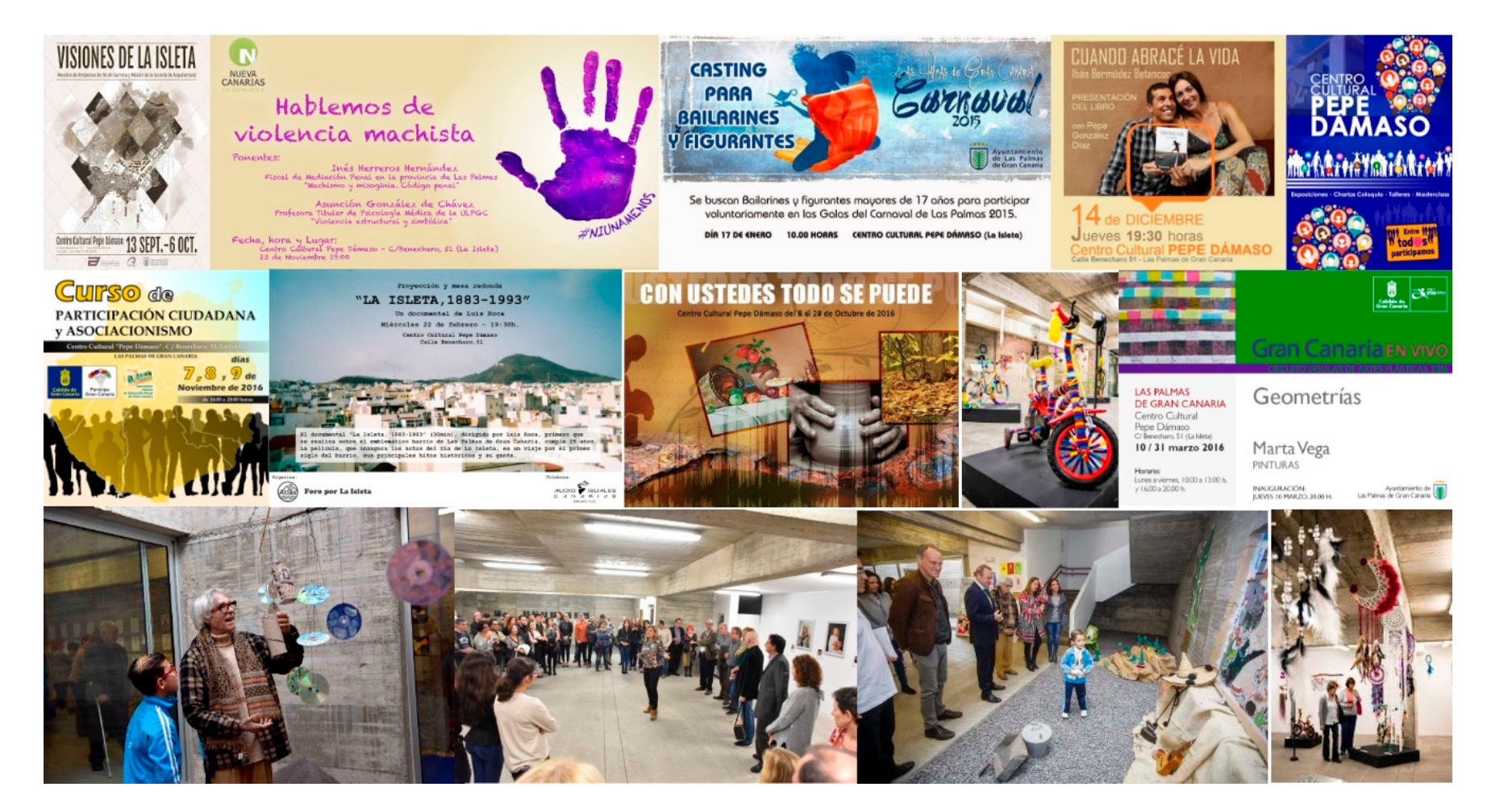
Figure 5. Example of the various social and cultural activities currently being carried out in the Pepe Dámaso Cultural Centre.