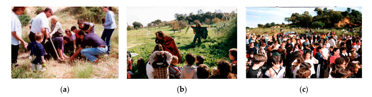
Figure 2. (a-c) Different activities carried out to design Moret Park.

The design of the park was finally undertaken by the architecture studio Seminario de Arquitectura y Medioambiente, based on bioclimatic and environmental criteria and with the innovative inclusion of a professional mediator between the public administration and citizens. Thanks to the participatory process, the park was officially opened (Figure 3) to great success and with mass attendance by citizens. In spite of being an incipient urban regeneration action, the initial participatory dimension led by citizens was key to the successful execution of the project and its subsequent acceptance by the public.