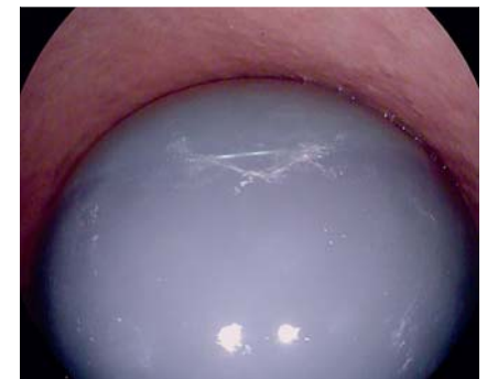
► Fig. 3 Endoscopic view showed a distended balloon with an air–fluid level. The balloon was partially obstructing the pylorus and causing gastric outlet obstruction.

Dr. Gonrand Lopez-Nava is a consultant for Apollo Endosurgery, USA; USGI Medical, USA; and Nitinotes, Israel.