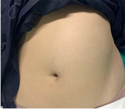
► Fig. 1 The patient presented with abdominal pain and distension at 7 weeks after intragastric balloon placement. Examination revealed a visible bulge in the left upper quadrant. The distended balloon was easily palpable.

Intragastric balloons (IGBs) are an established, minimally invasive treatment option for obesity. Multiple studies have shown them to be safe and effective in achieving weight loss at 6 months and 1 year. IGBs with newer designs, various filling volumes, and longer indwelling