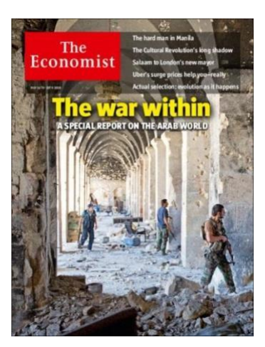
Figure 6. The Economist, 14th May 2016

Since the French flag is the cover itself, the colour analysis may seem pointless. However, the fact that the red drops (which represent blood) are placed on top of the white stripe symbolises that the innocence and purity of the people have been damaged forever by the brutality of the attacks.