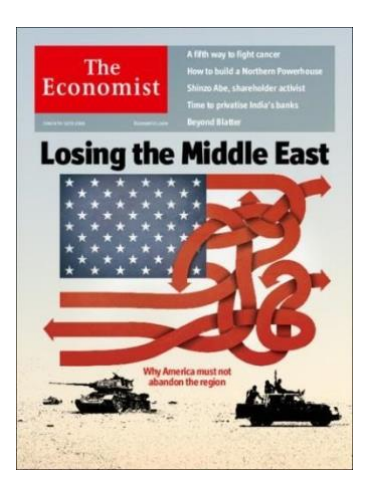
Figure 4. The Economist, 6th June 2015

Regarding colour, black stands for everything that frightens us. When we are young, we are afraid of the dark and the unknown, and that is exactly what these terrorists embody. Furthermore, the colours seem a bit washed-out, like a picture which was taken a long time ago and has now faded.