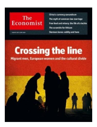
Figure 9. The Economist, 16th January 2016

The ninth cover (Figure 9), dating from 16th January 2016, depicts two situations that are happening in Germany. First of all, Angela Merkel's willingness to welcome asylum seekers into her country has turned into regret after they assaulted some women in Cologne. This is making people choose sides: you either still support the migrants' arrival or you think that they have "crossed the line" and that their values and views on women have nothing to do with the freedom found in the West. Secondly, because now the population is suspicious of them, they are isolated and treated as mere shadows, whose existence is ignored.