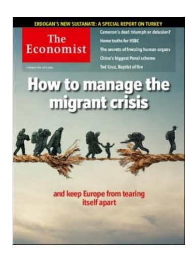
Figure 10. The Economist, 6th February 2016

The tenth cover (Figure 10), dating from 6th February 2016, shows how Europe's welcoming attitude towards migrants and their commitment to support and aid them has faded towards the desire to just get rid of them. Although at the beginning European countries each promised to shelter thousands of migrants, the reality is that only Germany and Sweden have kept their promise.