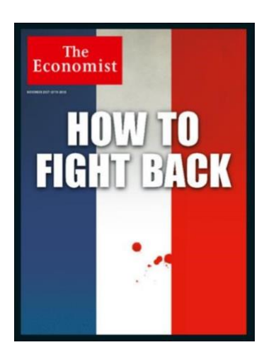
Figure 5. The Economist, 21st November 2015

Regarding colours, the pale yellow and blue resemble the view that someone would have of an Arabian desert, their vision hazy from the heat. Likewise, the American government seems to be feeling just as hazy due to all the choices they have, a range as wide as a desert.