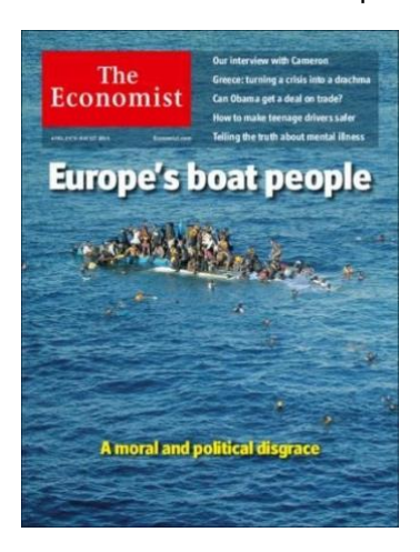
Figure 7. The Economist, 25th April 2015

represented in our data collection by four covers. In each case they focus on the migration of Syrians in order to find a better life in Europe.