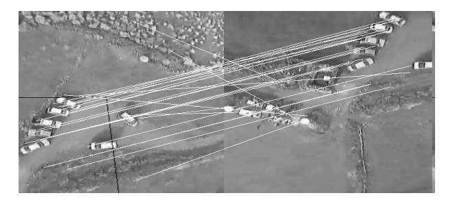
Fig. 5. Example of matching between two images captured at different flight altitude