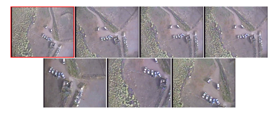
Fig. 3. Set of images captured at different altitude: higher (above) and lower (below) altitude. Red box denotes the reference image.

Original SURF algorithm over these images detects a large number of easily confused keypoints. Confusing keypoints should be filtered during the matching process. For instance, there are repetitive shapes on the images such as