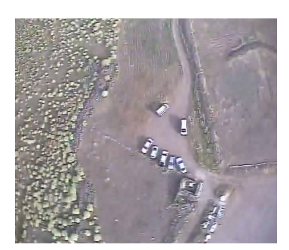
Fig. 1. Scene taken from a commercial cartographic (right) and the scene taken from our UAV (left)

That area belongs to a rural area in Gran Canaria Island, which is not correctly mapped yet by commercial aerial imagery.