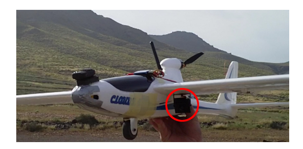
Fig. 2. Used Unmanned Aerial Vehicle, the camera position and orientation

The Fig. 2 shows the used UAV in the present work. This vehicle is provided with low cost camera. It is a mini camera 1/3" Sony CCD 420 TVL, with a