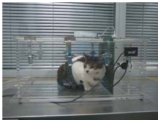
Figure 1. Cat placed into a plethysmography chamber connected to commercial software, used to analyse the respiratory patterns. The chamber is placed in a quiet room with calibrated temperature and humidity, and cats are acclimated to the chamber for 5 minutes after which data are recorded for a period of 12 minutes.

BWBP was performed as previously described by