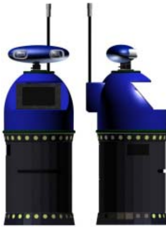
Figure 1: Front and side views of Eldi

transmission of color video and sound from the robot, a touchscreen, loudspeakers and two degree of freedom head. The robot is equipped with an active vision system that comprises a pair of Sony EviG21 motorized color cameras housed in the head, a Directed Perception pan-tilt that articulates the neck, and a PCI frame grabber. Basically, the processor installed in the mobile platform controls the motion, localization, obstacle avoidance, selects the video input for transmission and power resources of the whole system using a digital Port Control Board. It runs under the Linux O.S. The second “upper” system, that runs under Windows NT 4.0, controls the whole robot and develops all the interaction with user through a number of devices that include the vision system. Communications with off board systems are routed through the Linux system. The robot is also capable of recognizing voice commands from a number of people.