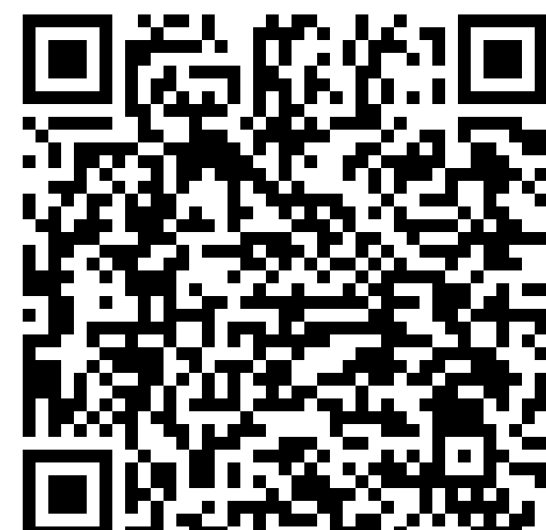
V Simposio del Grupo Regional ICLHE Spain