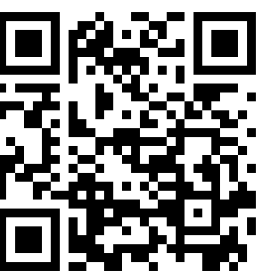
5th International EAPCRETE Conference