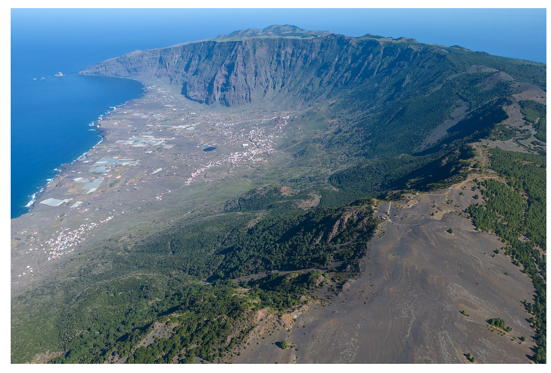
Figure 2. Landscape of El Golfo Valley (Frontera).

Since the last decades of the twentieth century, human mobility underwent increased complexity. The economic dynamism spurred by the expansion of tropical crops, the growing recognition of island wines and increasing tourism was accompanied by a notable influx of