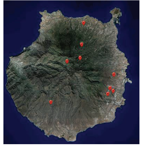
Figure 1. Study pig farms in Gran Canaria

The island of Gran Canaria has a total 136 pig farms, the majority of which are small and family production. However, 10% of these farms account for more than 90% of the census and are industrial farms, in some cases close to environmental protection zones and are shown in Figure 1. For many years, livestock waste has been used as fertilizer in fields or farmland. However, in recent years, the gradual disappearance of these small farms and the increase in intensive livestock farming, the high number of animals per farm and the abandonment of traditional systems have led to a greater fluidity and dilution of the waste generated, thus increasing its volume, but there is not always enough arable land for its correct disposal [30].