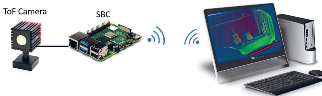
Figure 2. System architecture.

In this section the system architecture is proposed, figure 2. Basically, the system is formed by a ToF camera and a SBC. In addition, a server has been used to store the gathered point clouds and visualize the 3D representation. Next, both ToF camera and SBC are described.