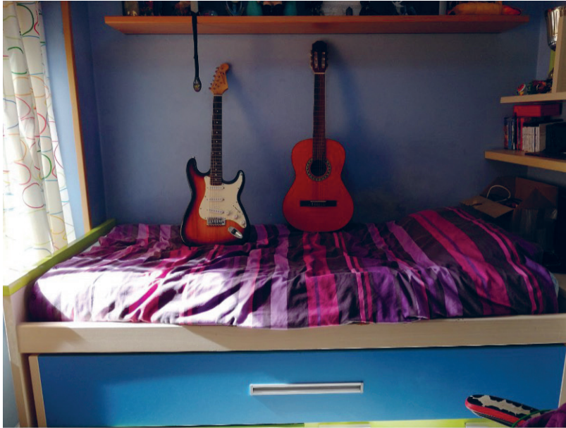
Figure 4. Real scene.

In our ongoing work, we are planning to generate a map of the environment from several point clouds using the IndoorGML standard. In addition, OpenCV library can be used for the identification of both people and objects, and therefore a better feedback about obstacle is notified to the user.