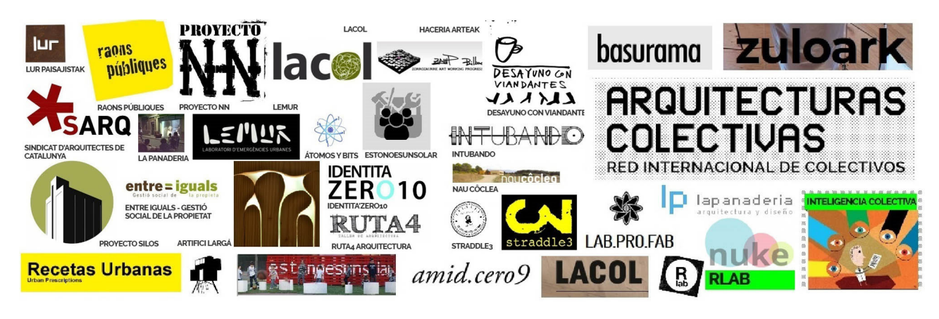
Fig. 1. Logos of various collectives, extracted from https://arquitecturascolectivas.net/

groups, which are usually assigned by default the status of alternatives or anti-system, have become the object of interest of the system, as established: "In the search for alternatives, the architect groups are taking more and more prominence. These are proposals by creative groups and activists who are looking for the possibility of making their proposals and those of the social environment, and which is advancing in the shaping of what would be a city of new subjectivity and alternative urban planning the objective that characterizes these groups is to project and do useful and significant things with few means and economy of resources in close relation to their context [...] It is also true that these groups are of disparate quality and can be ephemeral: there are more radical ones and committed and others are only concerned with finding a professional niche for financing and promotion" [Montaner 2014, p. 151].