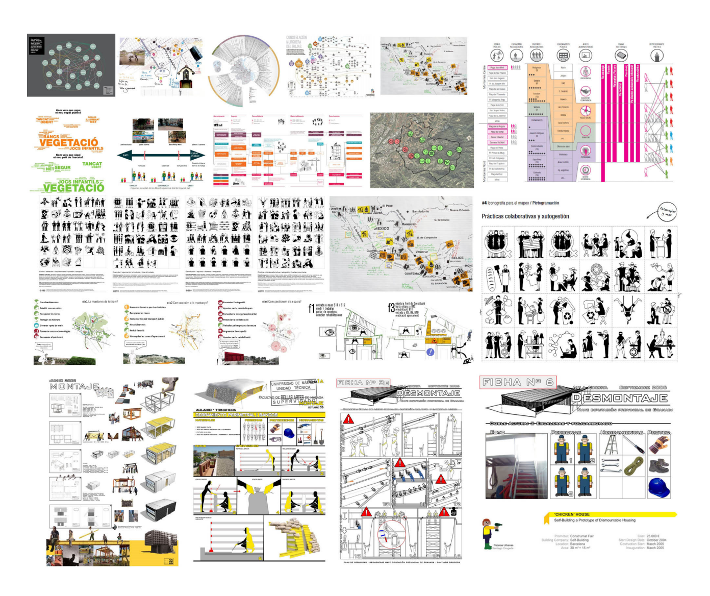
Fig. 3. Diagrams and pictograms, graphic resources in the manuals of Lacol [Lacol Arquitectura Cooperativa 2018], Iconoclasistas [Risler, Ares 2013] and Recetas Urbanas [Guzmán 2018].