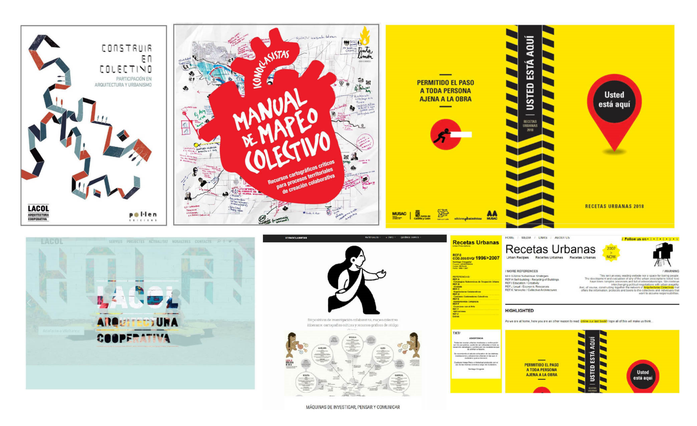
Fig. 2. Covers of the manuals and web pages of Lacol [Lacol Arquitectura Cooperativa 2018], Iconoclasistas [Risler, Ares 2013] and Recetas Urbanas [Guzmán 2018].