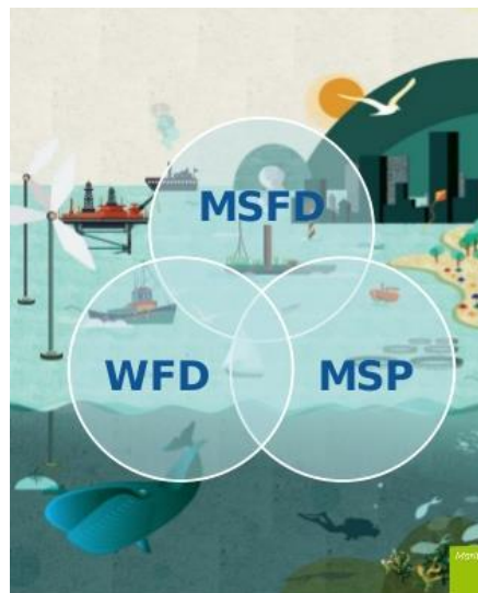
Figure 1 - Schematic overlapping of environmental legislation with MSP process and Directive 2014/89/EC

One of the PLASMAR objectives is to develop and apply ecosystem-based approach methodology on Blue Growth sectoral development, in order to find the balance between maritime sectors development and environmental planning, supporting socio-economic growth and ensuring environmental services. This specific action, (2.1.1b), includes various analyses on the status of implementation of the EU environmental legislation in the Macaronesian region. This study lists the requirements of the EU environmental directives which are applicable to marine and coastal areas, current implementation status, including applied actions. Finally, based on the results of these studies, we expect to identify synergies and barriers to the development of the maritime sectors and environmental planning. It is necessary to understand what is already done on the implementation of the environmental policies to be applied, so it can be considered and potentially reused in the Maritime Spatial Planning process (Figure 1).